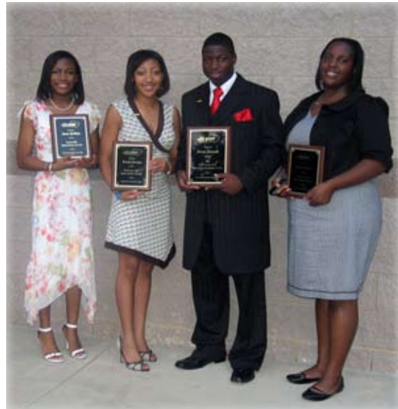
Student of the Year award recipients were recognized at the Leadership Banquet on Thursday, June 12.

The South Carolina AHEC System congratulates the accomplishments of these and all participants of the 2008 Institute!