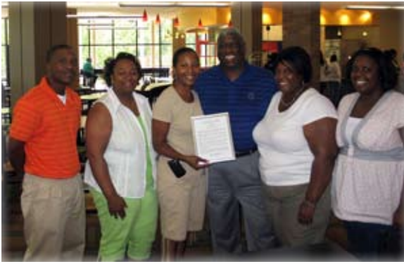
The Health Careers Program Council received the proclamation from Greenwood Mayor Floyd Nicholson.