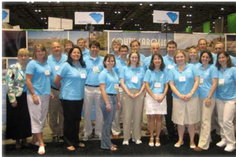
The team representing South Carolina included Directors and Residents from each of the eight South Carolina Family Medicine Residency Programs.

Programs, visit www.scahec.net and select Graduate Medical Education.