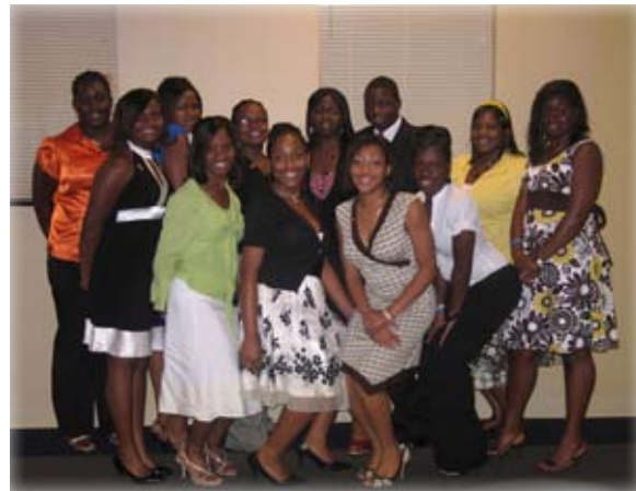
All award and scholarship winners posed for a group photo.