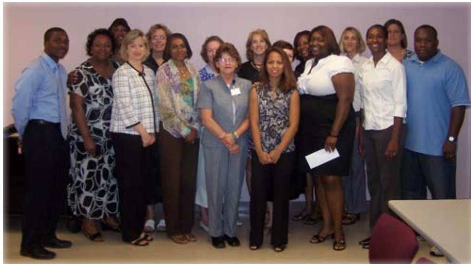
The Lowcountry Coalition awarded five scholarships to health career students. Lowcountry Coalition members and award recipients are pictured at the award presentation.

Additional information about the Lowcountry Coalition for Health Careers can be found at: www.lowcountryrc.org .