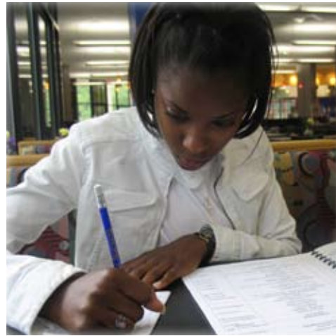
Academic preparation is an important part of the Institute.

the opportunities for participants to connect with students from across the state who have similar interests and ambitions. Connections were made that may serve to strengthen the support networks towards personal success for each participant.