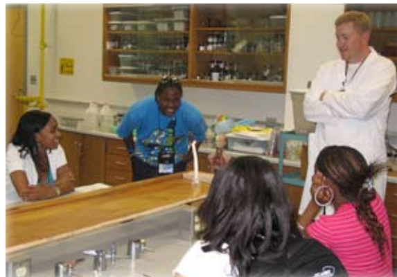
Students participate in interactive sessions facilitated by practicing healthcare professionals.