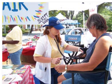
SCRIPT Student Provides Screening at Community Event

The South Carolina Rural Interdisciplinary Program of Training (SCRIPT) held five sessions throughout the state this past summer. The program is sponsored by Lowcountry AHEC, in collaboration with Mid-Carolina, Pee Dee, and Upstate AHEC Centers. The project is 13 years old and for the past four years SCRIPT has been a statewide project involving all South Carolina AHEC Centers. SCRIPT has the goal of preparing health professions students to deliver culturally acceptable care in rural settings from an interdisciplinary, community focused perspective. Living and practicing in a rural community enables health professions students to learn that rural health care presents unique challenges as well as opportunities for a positive, high-quality lifestyle, both personally and professionally.