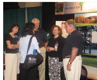
Residents Visit Booths During Fair

Residents circulated through an exhibit hall and were able to discuss career options directly with employers. Throughout the morning, door prizes that were provided by the exhibitors were given away and added a touch of excitement to the Fair. This year's exhibitors reported being very impressed with the quality of the participants.