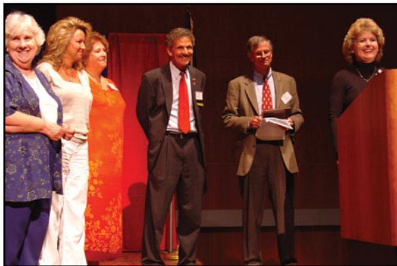
South Carolina AHEC Representatives Accept Award at NAO Leadership Conference in Omaha