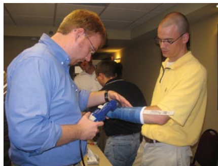
Medical Students Practice Applying and Removing Casts

After lunch, each student selected four hands-on workshops which he/she could attend conducted by South Carolina AHEC's eight Family Medicine Residency Training Program Directors and faculty.