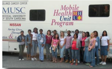
Students Toured the MUSC Mobile Health Unit

The Academy was facilitated by practitioners from throughout the Tri-County community and nursing