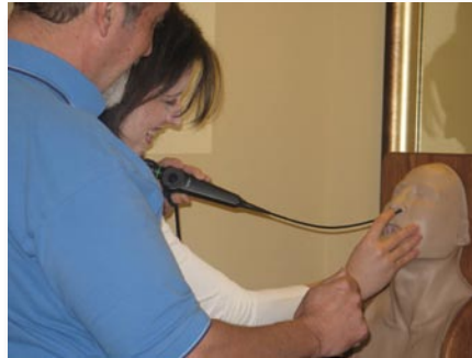
A Medical Student Practices Using a Scope on a Simulated Patient