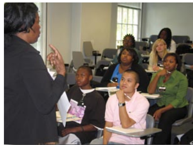
Practicing Professionals Served as Facilitators

and dental students from the Medical University. It was filled with 64 hours of didactic and clinical seminars designed for students at the pre-health training level. Guest faculty facilitated sessions that included topics such as academic skills development, pharmacology and gross anatomy. Clinical hours were spent in campus labs and clinics and evening forums provided a time for the Academy Fellows to talk with practicing professionals and health professions students.